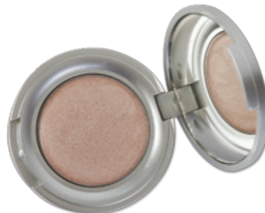
GLISTEN UP! HIGHLIGHT