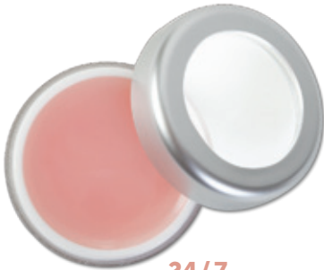
24/7 LIP TREATMENT