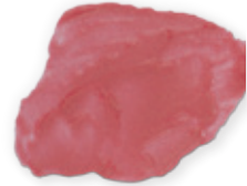
LIVE IT UP LIP GLOSS