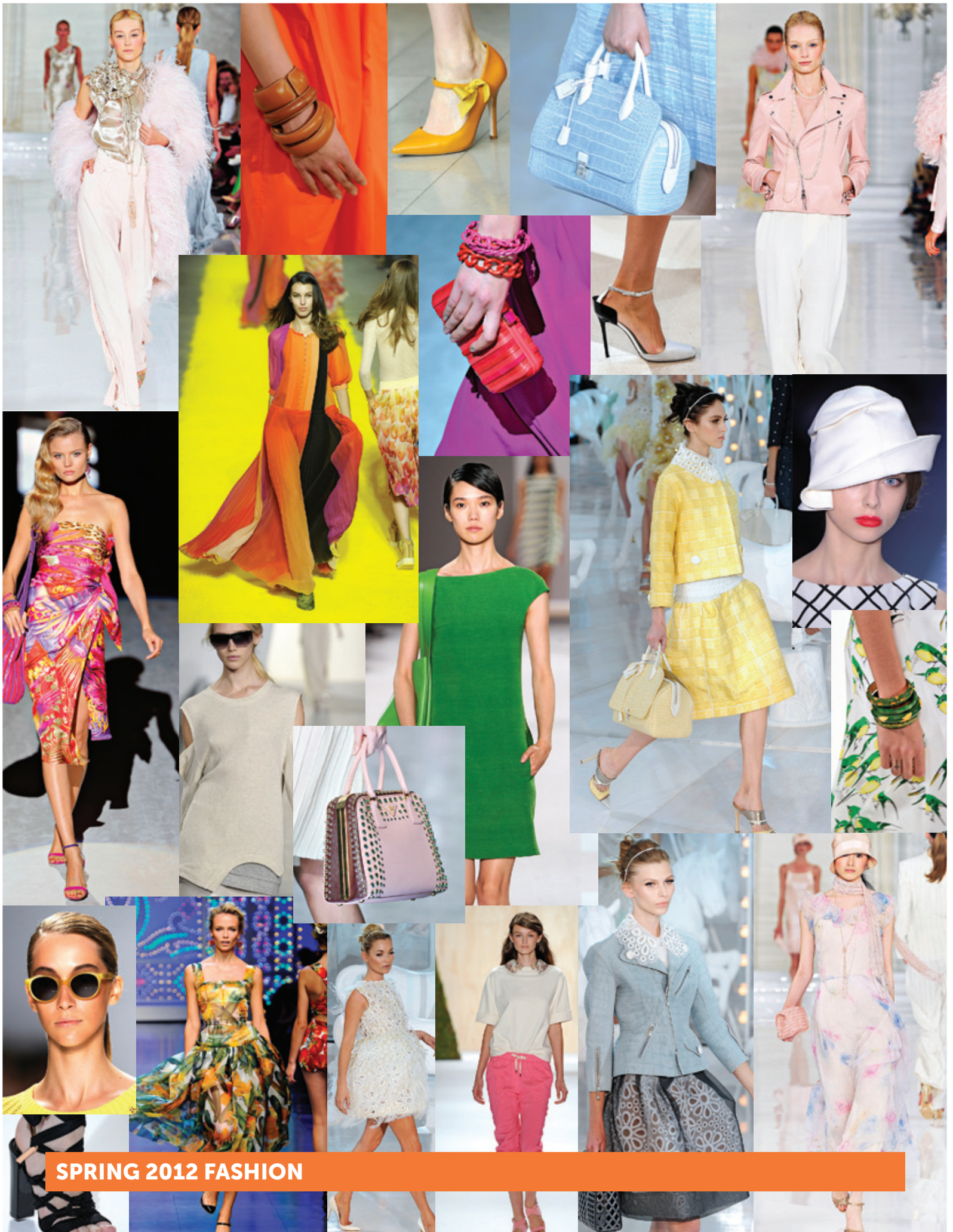
SPRING 2012 FASHION