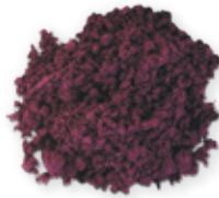
CELEBRATE EYESHADOW ¼ tsp Matte Red ½ tsp Lapis ½ + ⅛ tsp Rubellite 2 tiny scoops Matte Black 3 tiny scoops Matte Blue