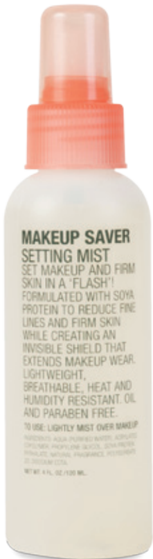
MAKEUP SAVER SETTING MIST