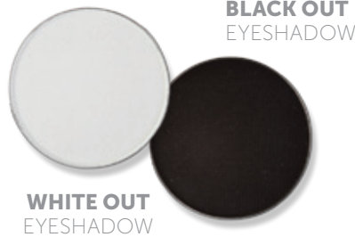
WHITE OUT EYESHADOW

Matte, primary colors that contain a high color concentration. They can be used alone or mixed together to create your own personalized color. Play with the shades to create rich vibrant colors that pop using basic color theory. Mix Vibrant Red with Vibrant Blue=Vibrant Purple. White Out will lighten and Black Out will darken.