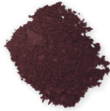
PRIVATE SHOWING EYESHADOW