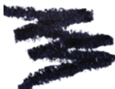
MARINA SKETCH STICK