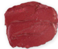
HONEYMOON LIPSTICK Butter Base .125 + .125 Russet .25 + .125 Magenta .25 + .125 Cocoa .25 White .125 + .125 Red Red .125 + .125 Wineberry 4 tiny scoops Champagne