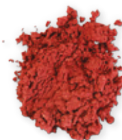
BLUSHING BLUSH 1 tsp Sunlight Gold ½ tsp Rubellite ¼ tsp Tourmaline 4 tiny scoops Agate 4 tiny scoops Russet Frost