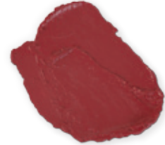
HAPPY ENDING LIPSTICK