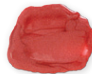
FOREVER LIP GLOSS Lip Polish 3 drops Ruby Red 3 tiny scoops Coral Frost 5 tiny scoops Champagne Frost 6 drops Moisture Additive .5 Lip Plumper