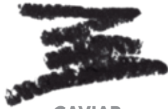
CAVIAR SKETCHSTICK FOR EYES