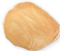
KEEPSAKE EYE GLAZE 10 pumps Pearl 10 pumps Thinner 3 pumps Fringe Benefit 1 lg scoop Gold Frost 1 sm scoop Crystal Frost 1 sm scoop Moonlight Pearl