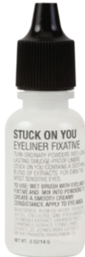
STUCK ON YOU EYELINER FIXATIVE