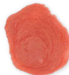
HELLO SEXY LIP GLOSS