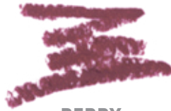
BERRY SKETCHSTICK FOR LIPS