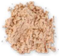
CHAMPAGNE COCKTAIL EYESHADOW ¾ tsp Light ½ tsp Sunlight Gold