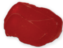
"I DO" LIPSTICK Butter Base .125 x 4 Blueberry .25 x 4 Wineberry .25 x 4 Coral 2 lg scoops Champagne Frost 6 drops Silkening Modifier .5 Moisture Additive