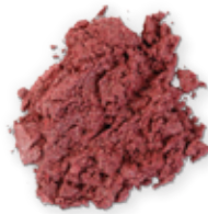
BUTTERFLY KISS EYESHADOW ½ tsp Rubellite ¼ tsp Crystal Frost ¼ tsp Rose Quartz ¼ tsp Translucent Modifier