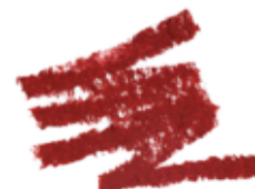
MAUVE SKETCH STICK