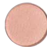
CHABLIS neutral, light pink-brown