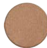
ROSE GOLD copper shimmer