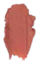
FAIR AND SQUARE Crème Base 3 tiny Copper Frost 4 tiny Crystal Frost 2 small scoops Pink Gold Frost 1 small scoop Sienna Frost 6 drops Silkening Modifier 3 ml Moisture Additive