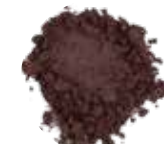
MATERIAL GOODS ½ † Onyx ¾ † Translucent Modifier 5 tiny Matte Red Color Adjuster 2 tiny Lapis 3 tiny Amber ⅛ † Agate