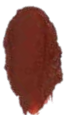
SOCIALITE Crème Base .50 + .25 + .25 Red Red .50 + .50 Brown .25 Ochre .25 Blackberry .125 Black