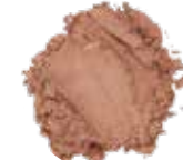
FINE ART ¼ † Alabaster ½ † Med. Mineral Powder ¼ † Sand Frost ¼ † Rose Gold Frost 2 tiny Antique Gold Frost 2 tiny Sienna Frost 1 tiny Amber 1 tiny Tigers Eye