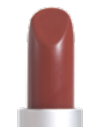
FIG YOURS red brown