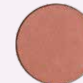
MAUVELOUS dusty mauve shimmer