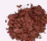
STEP FORWARD ½ † Lt. Mineral Powder ¼ + ⅛ † Rubellite ¼ † Rose Quartz ⅛ † Garnet Frost 2 tiny Sienna Frost 2 tiny Tigers Eye 2 tiny Amber 3 tiny Dk. Mineral Powder 1 tiny Sunstone