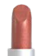
BRIGHT IDEA rose gold shimmer