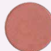
SPELLBOUND matte / pink brown