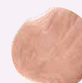
DEW DROPS ROSE GOLD bronze