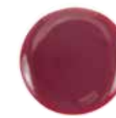
DRAMA QUEEN wine