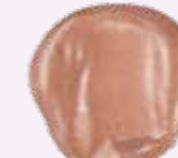
FACE VALUE 20 pumps Fringe Benefit 4 pumps Pearl 4 tiny Sand Frost 3 tiny Pink Gold Frost 3 tiny Rose Gold Frost 1 tiny Garnet Frost 2 tiny Gold Frost 3 tiny Antique Gold Frost