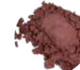
IN STYLE ½ † Translucent Modifier ½ † Garnet Frost + 2 tiny ¼ † Brass Frost 2 tiny Violet Frost