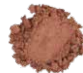
EN POINTE ¼ + ⅛ † Antique Gold Frost ⅛ † Rose Gold Frost ⅛ † Pink Gold Frost 2 tiny Bronze Frost ½ † Med. Mineral Powder ¼ † Translucent Modifier