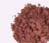
A SURE THING ¼ † Sienna Frost ¼ † Russet Frost ½ † Translucent Modifier ½ † Lt. Mineral Powder 2 tiny Bronze Frost