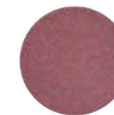
GLISTENING GARNET plum metallic