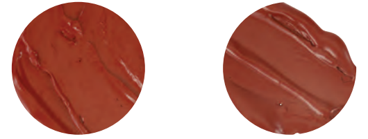
SCENE STEALER Crème Base 1.0+ .25 Mahogany .50 + .25 + .25 Russet .50 Wineberry .25 +.25 Ochre .25 Peach BERRY EXPOSED Crème Base 1.0 Wineberry .25 Black .50 + .25 Brown .50 Ochre .50 Peach .25 Russet 1 small Brass Frost 2 tiny Garnet Frost